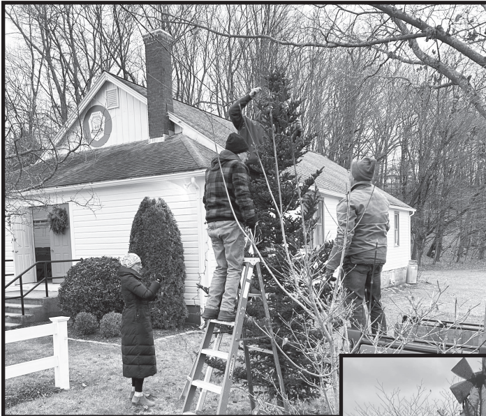
Lighting the Whigville Grange tree