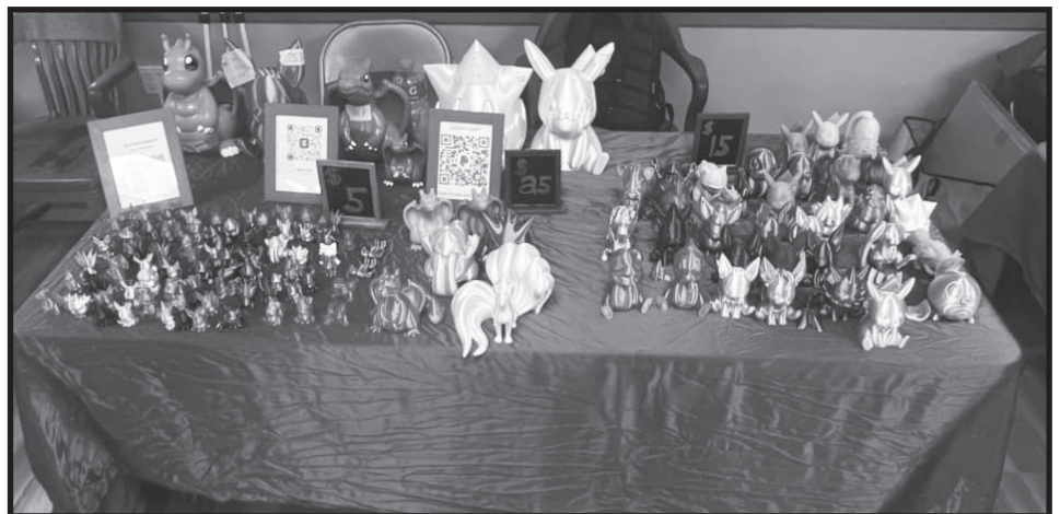
Ekonk Community Grange Holiday Bazaar