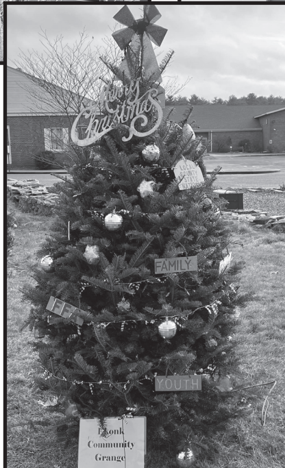
Ekonk's tree at Sterling Town Hall