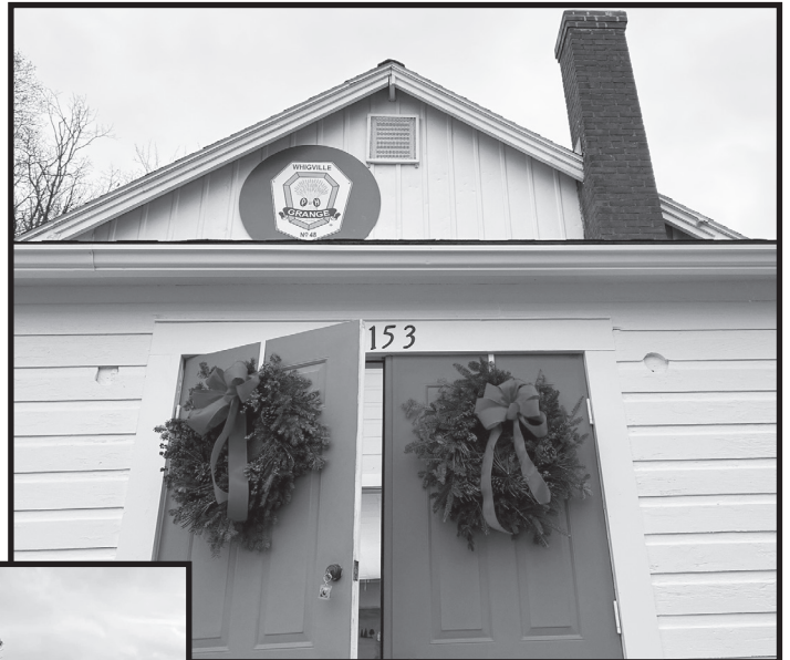
Whigville Grange Hall