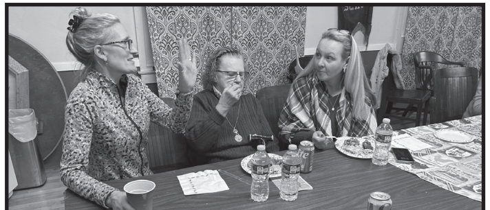
Whigville Grange members and friends celebrate "Whigsgiving" in November.

Melt the Winter Blues with a hot Meatball Sandwich