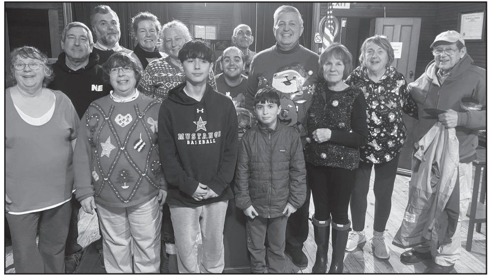
Members of Granby Grange gathered for a Christmas Party in Dec.