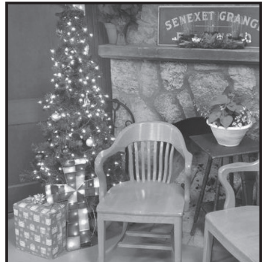
A cozy scene at Senexet Grange Hall