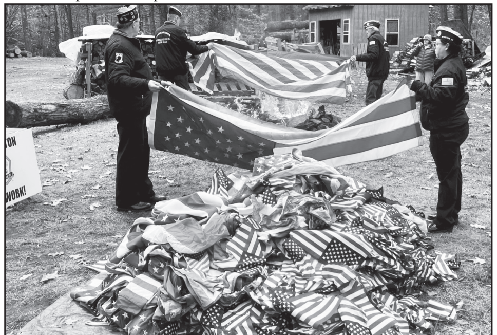
Riverton Grange/Riverton American Legion Flag Retirement Ceremony