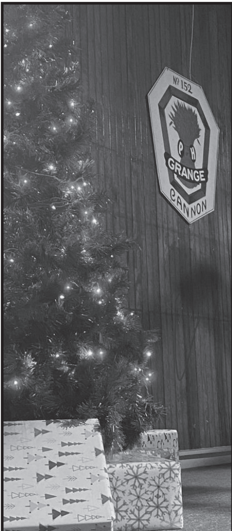
Cannon Grange's Christmas Tree